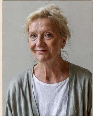
ELIZABETH STROUT Pulitzer Prize-Winning Author

Elizabeth Strout is the author of the New York Times bestseller Olive Kitteridge , for which she won the Pulitzer Prize.